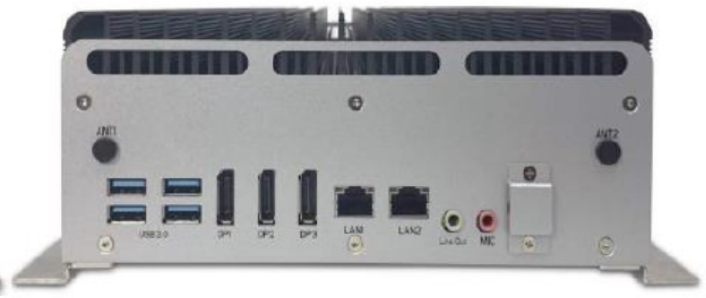
Rear view (GPU as an option)